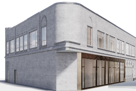
8501 New Utrecht Ave Brooklyn, NY 11214