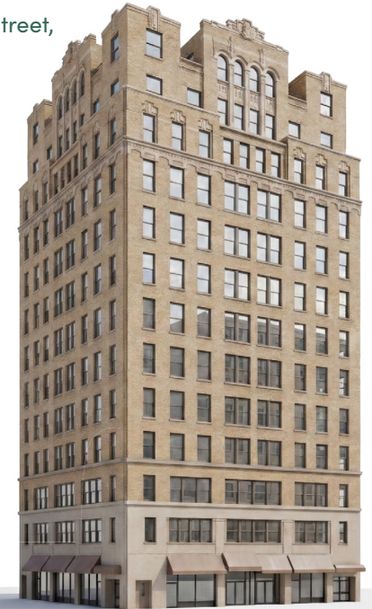
255 W 36th Street, NY 10018