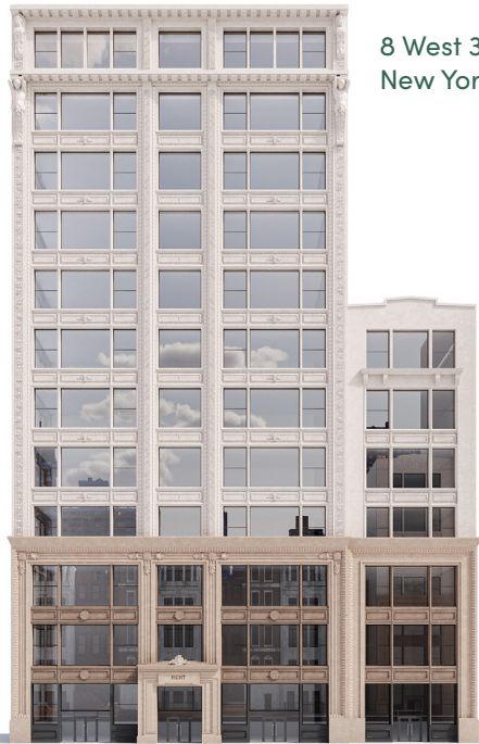
8 West 38th New York, NY 10018