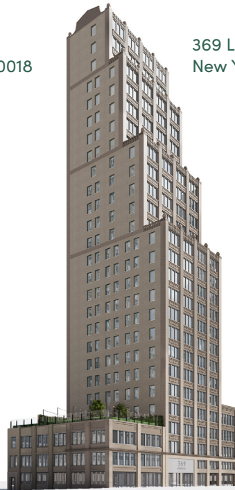
369 Lexington Ave New York, NY 10017